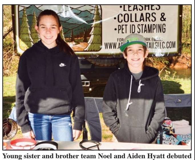
their Appalachian Tails business venture at the Choestoe Market on Friday. Vol. 112 No. 15

We are trying to use our property here for people that want to do it every now See Choestoe Market, Page 2A